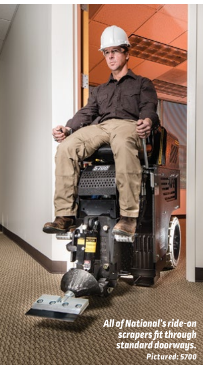
All of National's ride-on scrapers fit through standard doorways. Pictured: 5700

**Weight may vary depending on fill level and size of propane tank on machine.